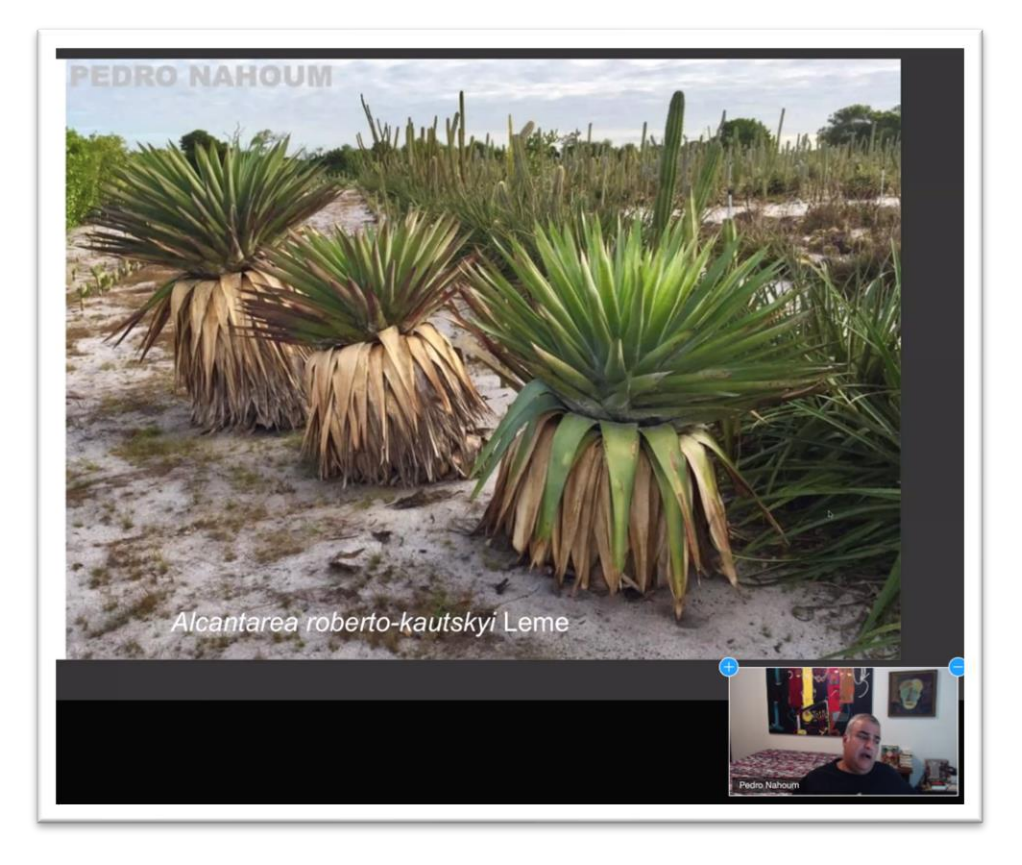
Doesnt it look like they are dancing? Alcantarea roberto-kautskyi and speaker

His business, Botanica Pop, is a pioneer in introducing Brazilian